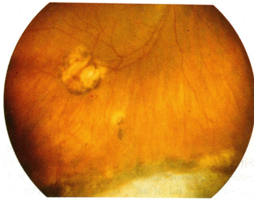
Figure 2A Old atrophic hyperpigmented chorioretinal scars compatible with toxoplasmosis in the right eye.