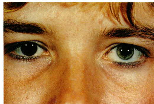
Figure 1 Evident heterochromia in a patient with bilateral congenital ocular toxoplasmosis and Fuchs's heterochromic cyclitis of her left eye.

Accepted for publication 22 November 1990