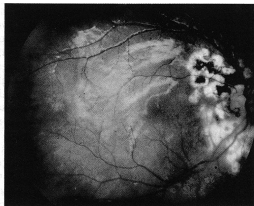
Figure 2 Postoperative fundus photograph.

have required a general anaesthetic. Vitrectomy and laser photocoagulation followed by fluid/gas exchange seemed to offer the highest chance of success with a single procedure (and anaesthetic), and it was agreed to proceed with surgery.