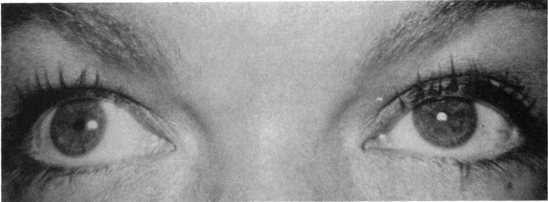
FIG. 3 Patient 1. Positive reaction (moiosis) to 2.5 per cent mecholyl and \frac{1}{4} per cent pilocarpine bilaterally