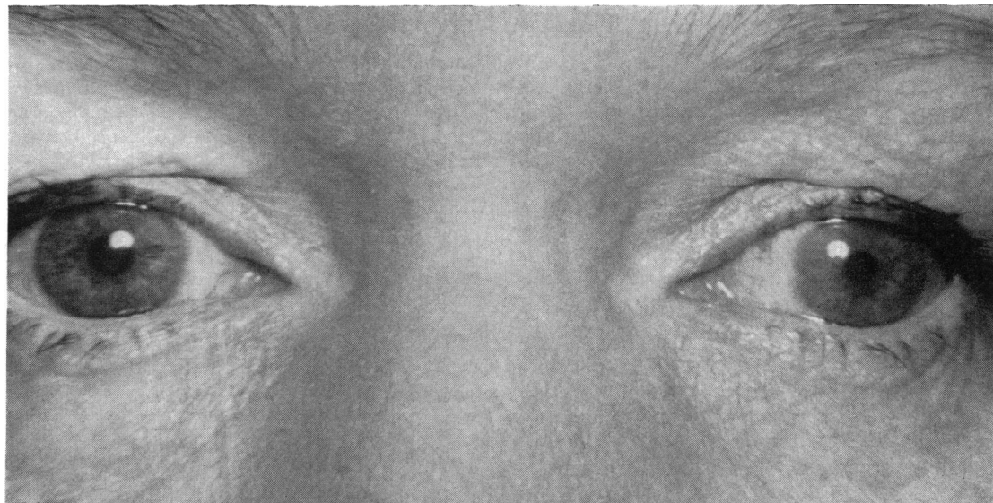
FIG. 5 Patient 2. Positive miotic reaction on the left to mecholyl \frac{1}{4} per cent and pilocarpine \frac{1}{4} per cent