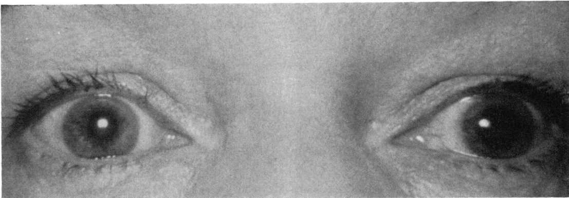
FIG. 4 Patient 2. Left pupil in dim light larger than right (reverse in bright light) did not react to light directly or consensually