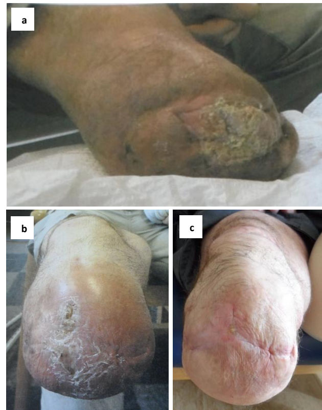
Figure 3: The condition of the Case #3 patient's residual limb (a) in its worst condition in 2011, (b) in 2013 and (c) in March 2019, after continued use of a perforated liner (since 2016) with elevated vacuum suspension and hydraulic ankle (since August 2017).

He was fitted with a perforated cushion liner, in conjunction with a passive vacuum, in 2016. In 2017 this was upgraded to an EVS system that used the movement of a hydraulic ankle unit to draw greater vacuum levels. After three months of using this prosthetic prescription, the patient reported that he thought it was “doing a great job” of keeping his skin dry; he was wound free and had had no residuum problems. The patient has continued to use this prescription for over a year, during which time his residuum remains in good health (Figure 3c).