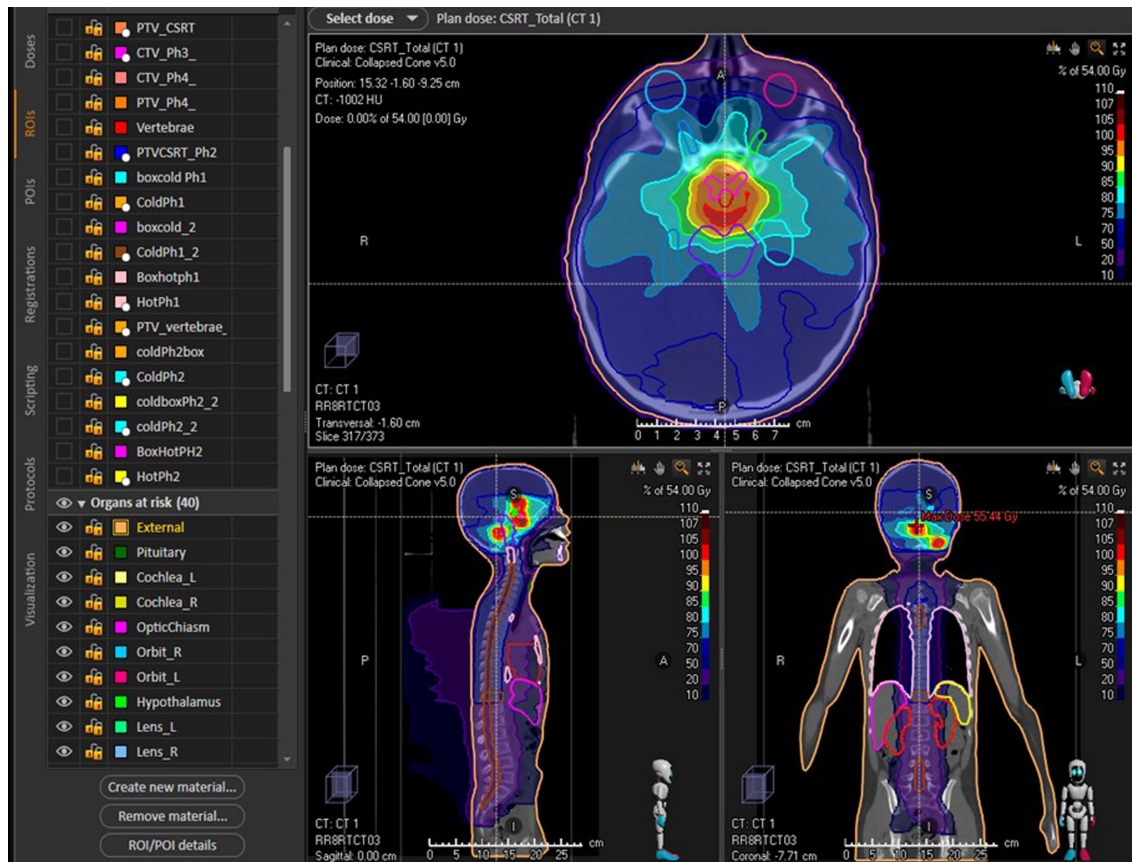
Figure 2 Planning dosimetric scans for delivery of craniospinal radiotherapy using volumetric-modulated arc therapy (VMAT) for a metastatic ependymoma. Isodose The colour scale represents the percentage of the tumoural dose.

of image-guided RT (IGRT) and arc-based therapies like VMAT (Fig. 2) and helical tomotherapy. In IGRT, imaging techniques like CT and MRI are incorporated to increase precision in planning and daily treatment. Arc therapy allows patients to be treated from a full 360° beam angle thereby reducing treatment time. Tomotherapy (slice therapy) machines are a combination of a CT scanner and linear accelerator, where radiation is delivered in a fan-shaped distribution with the help of a continuous rotating gantry. This innovative technique provides