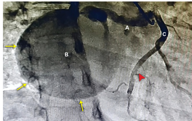
Figure 2. The coronary angiography in the left anterior oblique cranial view shows A) an aberrant vessel arising from the left main coronary artery, B) a giant sinoatrial aneurysm (arrows yellow), and C) the right coronary artery (arrow red).

An open-heart surgical operation was planned. The patient provided informed consent and was prepared for surgery. After all antiseptic measures were taken, a median sternotomy incision was made. A pericardiotomy visualized an aneurysmal sac, 70×70 mm in size, compressing the right atrium (Figure 3). Next, aortic and venous cannulation was done, a hypothermia of 32 °C was achieved, and a cardiopulmonary bypass (CPB) machine was used. Afterward, the aneurysmal sac was opened; it contained the incoming ostium of the aberrant SNA with a high-velocity flow into the sac and a second communication with the right atrium. The 2 communications were then sutured and closed with pledgeted PROLENE suture 4.0, and the other communication and the fistula between the sac and the right atrium were closed. Subsequently, the course of the feeding vessel into the aneurysmal sac was traced: it had a retro-