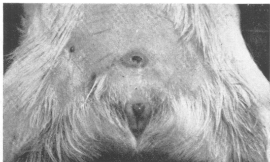
FIG. 1.—Guinea-pig No. 644 from Group I, treated with cortisone, at the time when the symptoms were most noticeable.

the whole surface. The thickness of these lesions varied between 2 and 3 mm., and they disappeared between the 21st and 28th day after their appearance. Fig. 2 illustrates the characteristic lesion observed in this group.