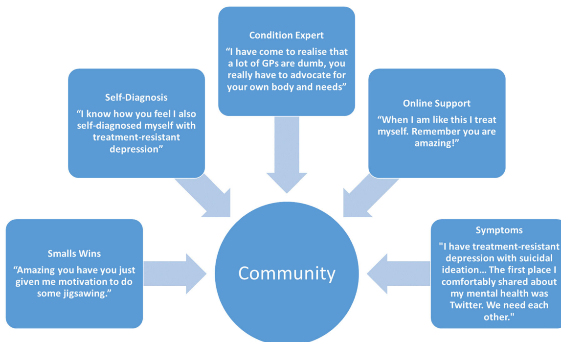
FIGURE 2 Community cluster.

users being grateful for the supportive community that Twitter can provide: