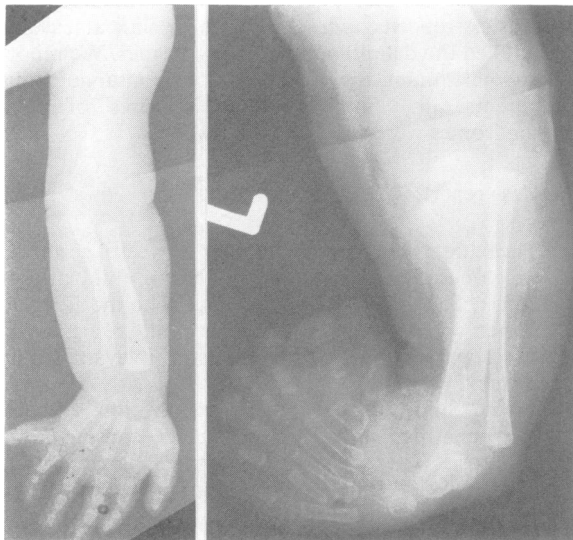
FIG 2 X-ray appearance of limbs. Note hypoplasia of tibia.