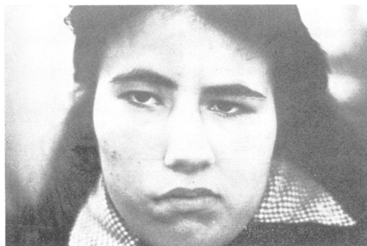
FIG 1 Proband at 15 years of age. Note facial asymmetry.

facial paralysis, but other neurological alterations, such as hemiplegia, quadriplegia, or paralysis of other cranial nerves, were absent. Ocular examination showed bilateral temporal subluxation of the lens (fig 2) and retractio bulbi. Pupillary size, shape, and reactions were normal, as were the eyelids, corneae, and fundi. An x-ray examination showed cervical scoliosis and fusion of the second, third, and fourth cervical vertebrae (fig 3). In addition, the patient had bilateral sensorineural deafness. Routine laboratory studies showed normal urine analysis and blood count and blood amino-acid analysis was also normal.