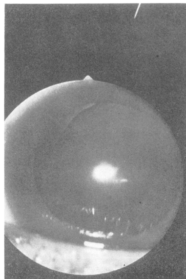
FIG 2 Subluxation of left lens. Similar finding was present in the right eye.