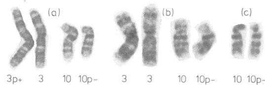
FIG 3 Partial karyotypes (G bands). (a) Mother of case 1 (family A, II.10) with translocation t(3;10)(p27;p13) . (b) Case 1 (family A, III.13) with del(10)(p13) . (c) Case 2 (family B, II.2) with del(10)(p13) .