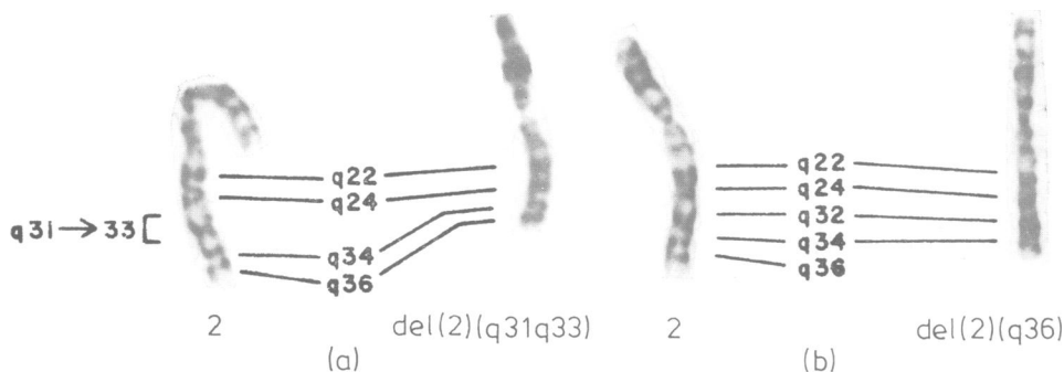
FIG 2 GTG banding of the chromosomes 2 of (a) case 1 and (b) case 2.

lobes, bilateral iris colobomata, mild microphthalmia and narrow palpebral fissures, left corneal opacity, beaked nose, maxillary alveolar ridge hyperplasia, borderline micrognathia, pilonidal dimple, shawl scrotum, bulbous tip to the penis, complete syndactyly of the 2nd and 3rd fingers of the left hand, bilateral simian creases, syndactyly of the second to the fifth toes bilaterally, and bilateral equinovarus. He had generalised jaundice and a weak cry, but manifested no cardiopathy.