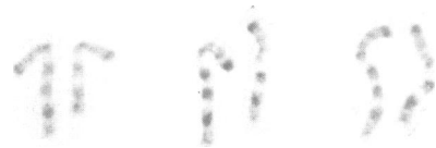
FIG 2 High resolution banding of chromosome 7 pairs demonstrating the duplicated q11→q22 segment.

The initial karyotype of the patient revealed an extra band on the long arm of one chromosome 7. Cytogenetic studies of parental and sib peripheral blood specimens were normal and failed to delineate the origin of the extra segment. High resolution