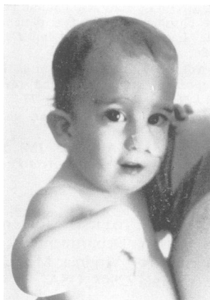
FIG 1 The proband at 10 months of age.

weight on appropriate therapy. IVP and abdominal CT failed to visualise the left kidney. An absent left ureteral orifice and a right sided ureterocele were found at cystoscopy. An atrophic left kidney was identified and removed at laparotomy. The patient returned to hospital several times because of intermittent febrile episodes (38 to 39°C). The aetiology of these episodes was never determined despite numerous cultures and immunological studies.