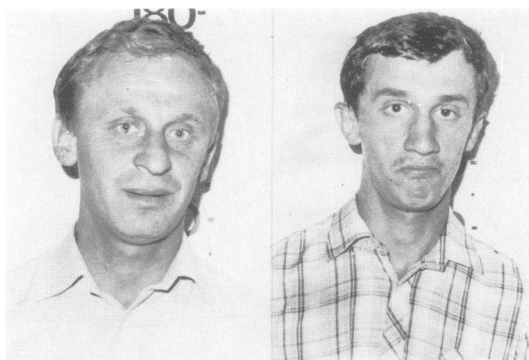
FIG 2 Proband (left) and proband's brother (right).

Received for publication 23 December 1982. Accepted for publication 19 February 1983.