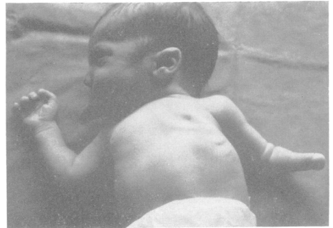
FIG 2 Chest deformity and abnormalities of the left hand.

to the nursery the following congenital abnormalities were observed: bilateral convergent strabismus, fixed and expressionless facies (fig 1), difficulty in swallowing, hypoplasia of the left pectoralis major muscle with partial absence of the upper costal cartilages (lung hernia), absence of the left areola, hypoplasia of the left forearm and hand (fig 2), and