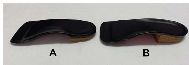
Figure 1 Inverted foot orthoses. (A) 15° inverted angle orthoses, (B) 25° inverted angle orthoses.

Rigid foot orthoses was manufactured based on Blake 35 inverted orthotic technique. This technique aims to invert the rearfoot and pronate the forefoot through the subtalar joint and longitudinal axis of the midtarsal joint in order to straighten the heel back to vertical. The orthotic insoles were designed with two variations: 15° inverted angle and 25° inverted angle (Figure 1).