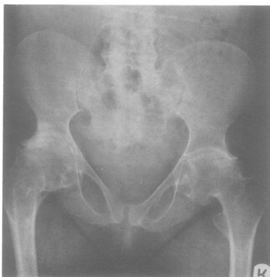
FIG 2 Radiograph of the pelvis.