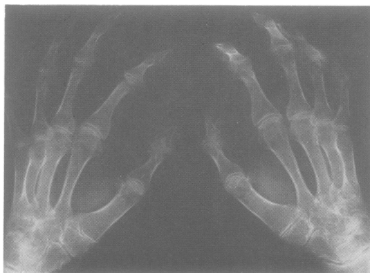
FIG 3 Radiograph of the hands.

described four families were Arabs and one was Greek. The only known instance of consanguinity was among one of the Arab families with four cases in two sibships. One of them had consanguineous parents and it is possible this may also be a feature in the other three Arab families.