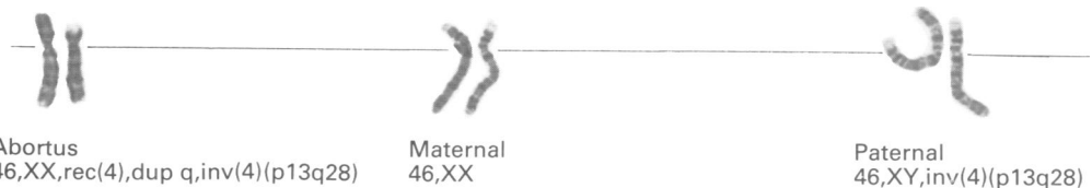
Figure 1 Chromosome 4 in affected family.

Received 2 July 1993 Revised version accepted for publication 18 August 1993