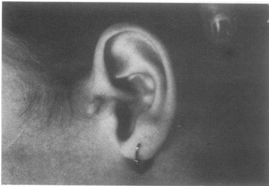
FIG 4 Left preauricular appendage in case 3.