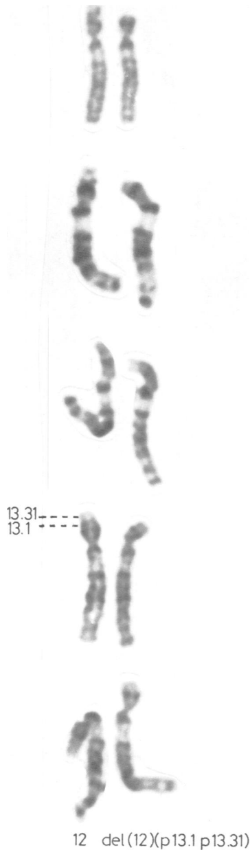
FIG 2 High resolution G banded examples of 12p-.

The first observation of monosomy 12p was made by Mayeda et al. , 1 who at the same time confirmed the localisation of the LDH-B gene to 12p. Eight further cases of 12p- have been described and have been reviewed by Kivlin et al. 2 Although in the greater number of these cases high resolution chromosome banding was not carried out, the indications are that