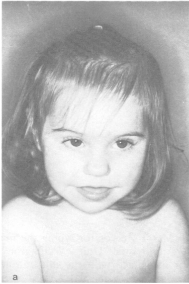
FIG 1 (a) Frontal view of face of index case.

type being interpreted as 46,XX,del(12)(p13.1→p13.3) (fig 2). Parental chromosomes were normal.