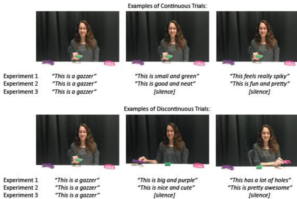
Figure 1. Schematic depicting sample trials in the learning phase for the Continuous and Discontinuous conditions in Experiment 1. Between each trial, the speaker briefly rested both hands in her lap and smiled at the participant. Note that in all conditions, the labeling trial occurred in either the first position (shown below) or second position (not shown).