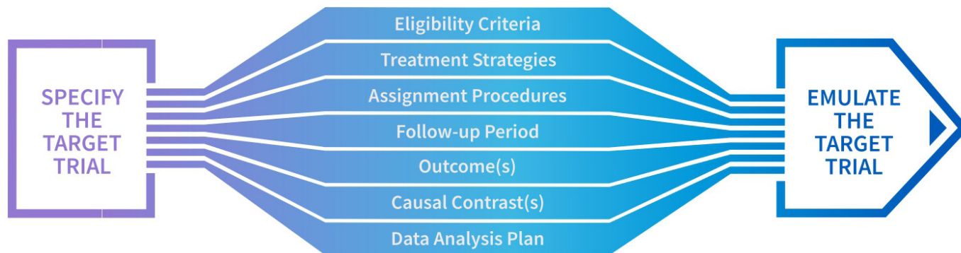
Figure 1 Elements relevant to both the specification and emulation of the target trial described by Hernán and Robins. 3

Application of the target trial framework requires the complete specification of the target trial protocol and its emulation (figure 1). 3 Hernán and Robins 3 provide a template for specifying a target trial and its emulation; however, there is currently no detailed guidance on reporting a study designed to emulate a target trial. Incomplete reporting of these studies limits the ability of clinicians, researchers, patients and other decision-makers to appraise and synthesise findings or interpret them to inform clinical and public health practice and policy. A reporting guideline that expands on the initial target trial emulation template 3 is needed to provide authors with comprehensive recommendations on how to completely and transparently report a study emulating a target trial.