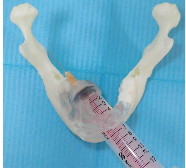
FIGURE 1: IANB device used in this study. This simulation of the IANB device using a syringe shows that the needle correctly reached the target point (mandibular lingula). IANB: inferior alveolar nerve block.

2.3. Local Anesthetic. Lidocaine 1% (1 mL, with no adrenaline; Xylocaine™ Injection Polyamp, Sandoz K.K., Tokyo, Japan) was used as the local anesthetic and injected using