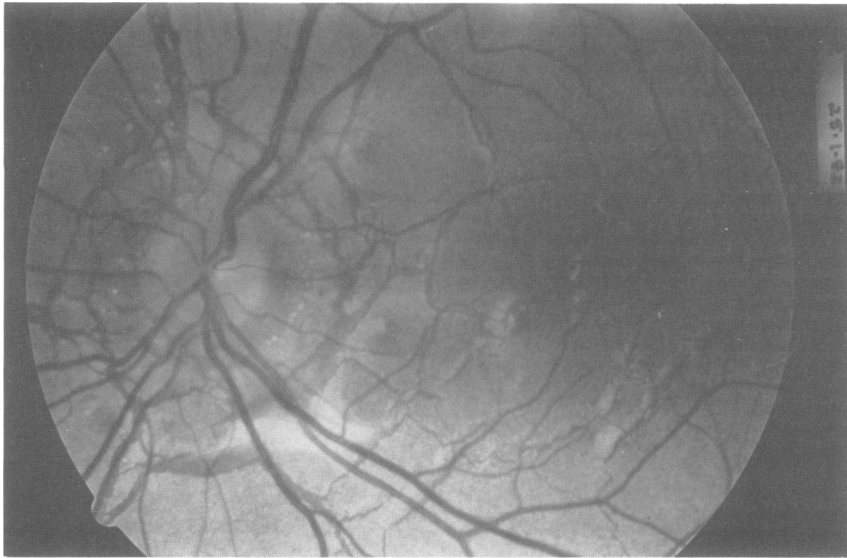
FIG 2 Ocular fundus of a PXE patient showing angioid streaks and retinal sclerosis.

are some of the therapeutic options. There is some evidence suggesting a beneficial effect from a low calcium diet. 9