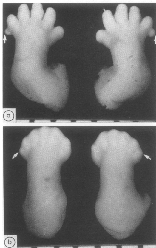
FIG 2 Upper (a) and lower (b) limbs showing supernumerary digits on the postaxial side (arrows).