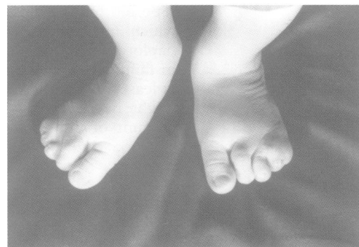
Figure 2 (Top) Feet of II·2 showing left 3-5 syndactyly and right 4-5 syndactyly. (Bottom) Feet of III·1 showing left 3-5 syndactyly and right 2-5 syndactyly.