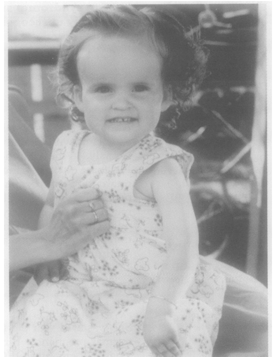
Figure 2 Patient 2 aged 2 years. Note large forehead.

The main characteristics of these two sisters were early postnatal macrocephaly, epilepsy, peculiar craniofacial features, autistic behaviour, and mental retardation. The large heads of our patients could be part of a dominantly inherited benign macrocephaly unrelated to their mental and neurological dysfunction. However, the early development of pronounced macrocephaly with a high and broad forehead was more likely to be related to a brain disorder. They had no loss of abilities and the disorder therefore did not seem to be progressive. We found no biological marker suggestive of degenerative or metabolic disease