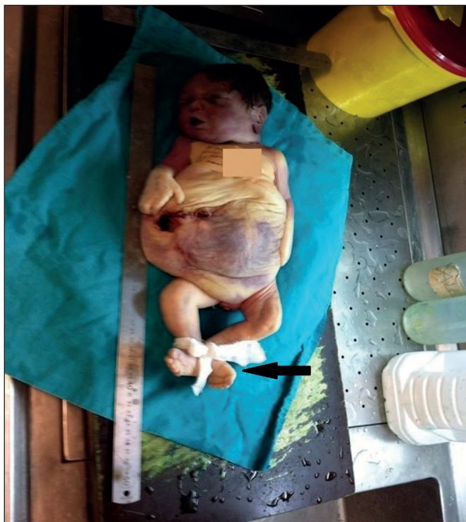
Figure 1: The newborn with bilateral club foot (arrow), and without abdominal wall muscles.

At the 33 rd week of gestation, the patient was admitted to the study center due to preterm labor and premature rupture of membranes. On the same day, she delivered a female newborn weighing 2250 grams with a first minute Apgar score of 3 and a fifth minute Apgar score of 5. Initial physical examination revealed absent abdominal wall muscles, bilateral club foot, imperforate anus and ambiguous genitalia which could be described as a phallus-like perineal structure without urethral or vaginal openings. Due to the existence of intercostal and subcostal retractions, the newborn was transferred to the neonatal intensive care unit and application of high frequency oscillatory ventilation was started. Chest and abdominal X-ray showed an abnormal bell-shaped thoracic cage, bilateral pulmonary hypoplasia, decreased ventilation in both lungs, lumbar scoliosis and a distended abdomen.