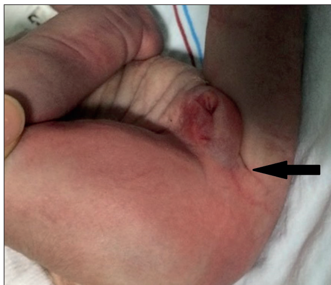
Figure 2: The affected newborn had imperforate anus (arrow) and a phallus-like perineal structure without any openings.

Permission for autopsy was obtained from the family. In addition to clinical and radiological findings, the foetus of 43 cm length showed potter's facies with manifestations of ocular hypertelorism, low-set ears, flattened nose and receding of the chin. There was cystic dilatation of the abdomen with deficient development of abdominal muscles, and defective insertion of the umbilical cord in the anterior abdomen. In addition, club feet were observed (Figure 1). The anal orifice was absent (Figure 2). Intraabdominal exploration disclosed a bladder measuring 12x9 cm. The bladder was filled with meconium, and an anastomosis between the 58-cm-long bowels and the bladder was observed. Both internal and external layers of the bladder were flattened, and increased bladder wall thickness was noted. No tumor was encountered. The urethra was undetectable. At the right side, an ureteral orifice was detected. Internal genital organs were not detected in the pelvic and abdominal regions (Figure 3). At the right side, a cystic and dilated kidney in its normal anatomical position, and an adrenal gland with normal dimensions were observed. The liver, stomach, spleen, pancreas, and heart were in their normal anatomical location, and no cardiac anomaly was seen. The lungs had a normal number of lobes.