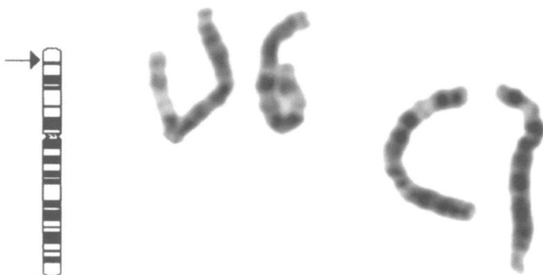
Figure 3 Ideogram, with breakpoint arrowed, and partial karyotypes showing the normal chromosome 6 on the left and the del(6p) on the right.

It is surprising that these eye findings have not been reported in all 6p deletion cases. This