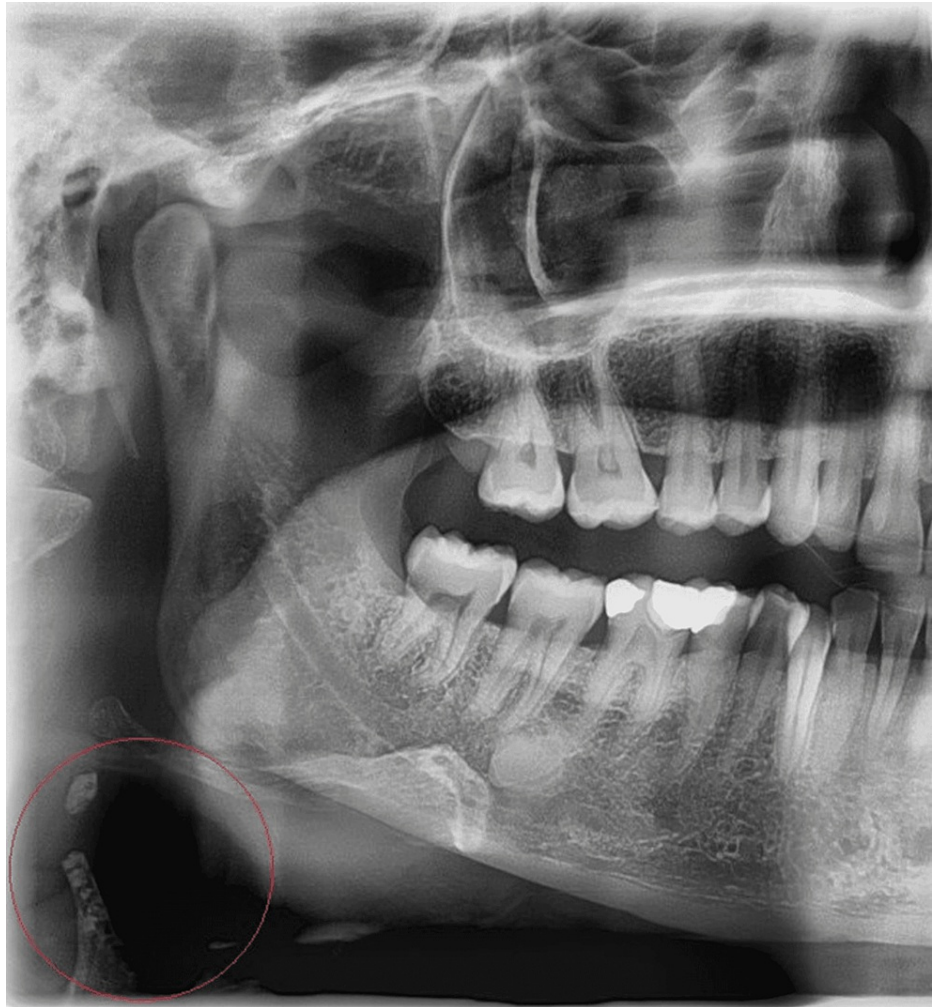
FIGURE 1: Calcified triticeous cartilage and calcified superior horn of the thyroid cartilage at the level of the third and the fourth cervical vertebrae in a 45-year-old woman.