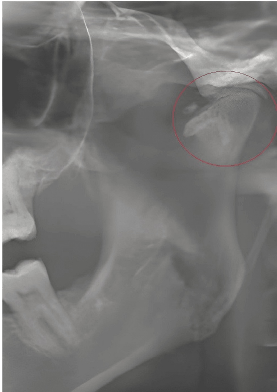
FIGURE 2: Panoramic radiography shows degenerative condyle changes and discrete radiopaque bodies in the left joint space of a 38-year-old woman.

A significant relationship was identified between the presence of specific calcifications, gender, and age of the patients. Tonsillolith was found more frequently in males, whereas CSHTC, CTC, and CAC were observed predominantly in females (Table 2). However, there was no statistically significant relationship between gender and the presence of STCs such as OSHC, sialolith, loose bodies (LBs) in TMJ, calcified lymph node (CLN), antrolith, osteoma cutis, phlebolith, and rhinoloth ( p > 0.05 ). The majority of cases diagnosed with OSHC, CSHTC, CTC, tonsillolith, CAC, LBs in TMJ, and CLN (Figure 3) were in the middle-aged group (Table 3).