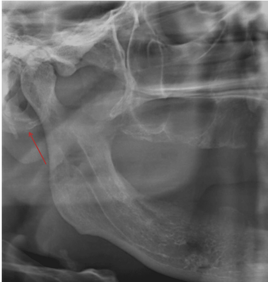
FIGURE 5: Panoramic radiograph shows a calcified maxillary artery at the level of the neck of the mandible in a 74-year-old man.