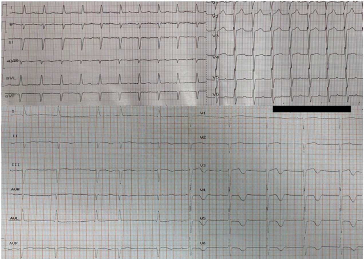
Figure 1. Atrial fibrillation with rapid ventricular response (above). Sinus rhythm with atrial extrasystole and negative T waves immediately after cardioversion (below).

was transferred to Intensive Care Unit where he was treated with high-dose oxygen, intravenous furosemide, high doses of nitrates and 300 mg amiodarone. An extra dose of 500 mg of hydrocortisone was also administered due to suspected allergic reaction. The arterial blood gases showed respiratory acidosis and increased levels of lactate. Due to hemodynamic instability and being on apixaban, emergent cardioversion was performed successfully. The electrocardiogram recorded after cardioversion showed 1 st degree atrio-ventricular block with atrial extrasystole, left axis, biphasic T waves at lead V2 and negative T waves in V3-V6 precordial leads (Figure 1). The echocardiogram showed normal left ventricular dimensions and wall thickness, reduced left ventricular ejection fraction to 35%, paradoxical movement of interventricular septum, diastolic