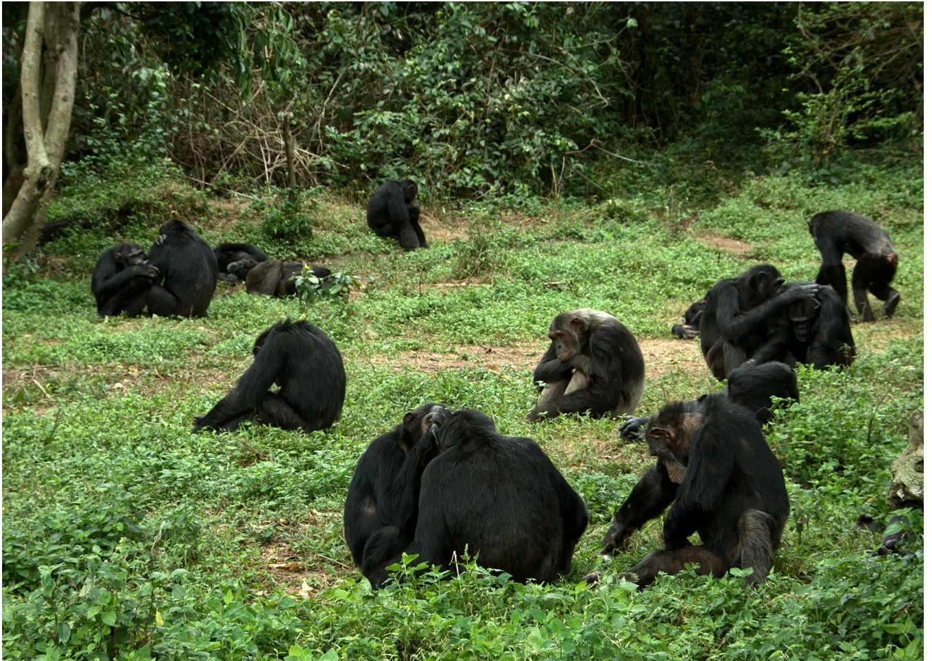
Figure 1: The chimpanzee group in the forest at Ngamba Island Chimpanzee Sanctuary. Our collaborative project adapted focal observational methods from a wild chimpanzee field site to the sanctuary population.