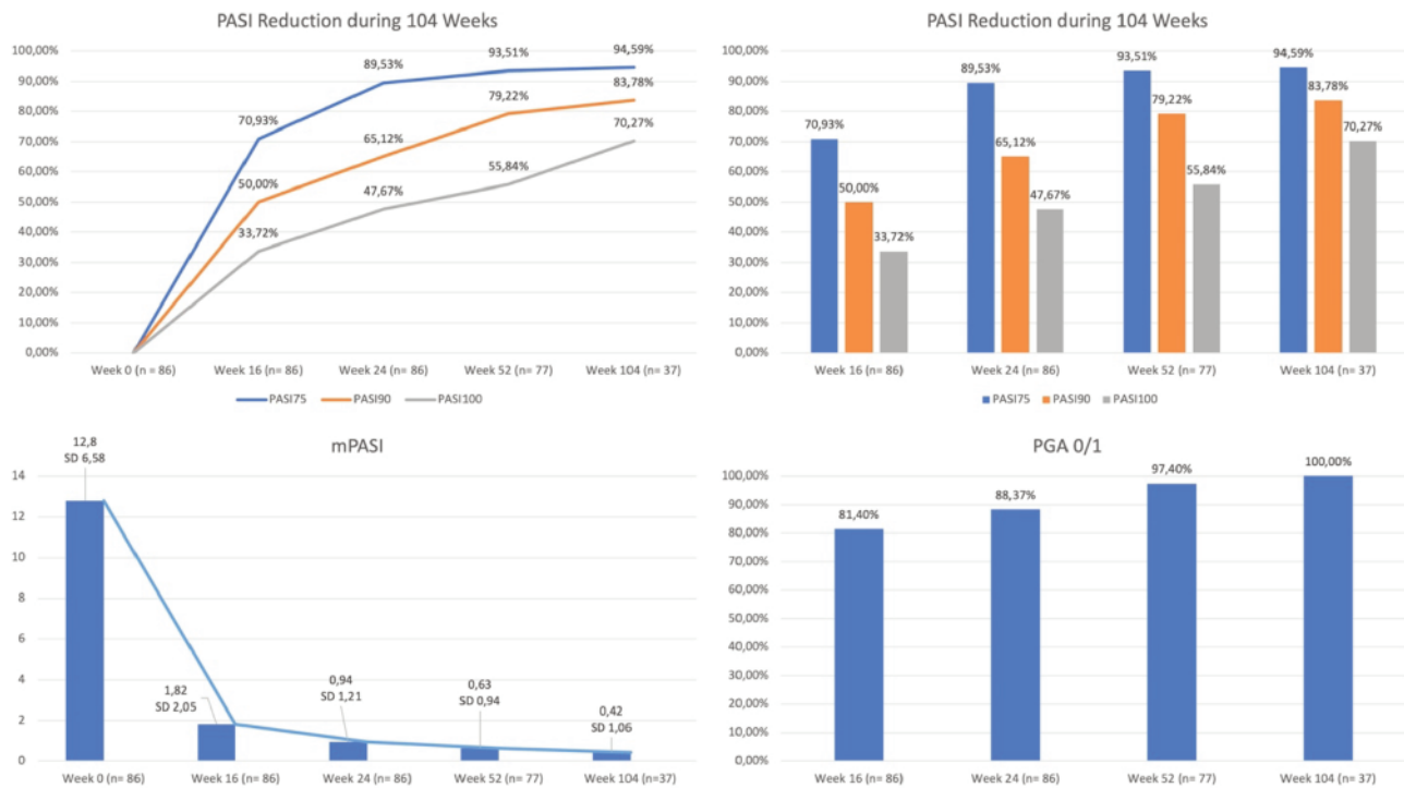
Figure 1. Mean psoriasis area and severity index reduction, percentages of patients achieving psoriasis area and severity index 100/90/75 compared with baseline and physician global assessment 0/1 during 104 weeks of treatment. PASI, psoriasis area and severity index; mPASI, mean psoriasis area and severity index; PGA, physician global assessment; SD, standard deviation.