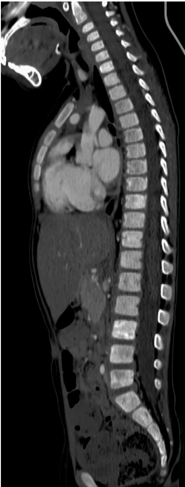
Fig. 2 CT scan shows extensive inhomogeneity of the vertebral metamers with hyperdense and osteolytic areas

constipation and urinary retention [5]. Moreover, large tumors can cause a compression of the venous and lymphatic drainage and of the renal artery, leading to hypertension. Neuroblastoma metastasizes by both lymphatic and hematogenous routes and almost 40% of neuroblastomas are metastatic at diagnosis. Hematogenous spread extends most often to bone, causing bone pain especially during ambulation, bone marrow, leading to cytopenia, skin, and liver, rarely to lung and brain parenchyma [6].