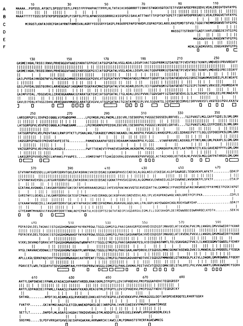
FIG. 3. Comparison of known ALS amino acid sequences. The deduced amino acid sequences of ALS genes are shown for lines A, tobacco; B, Arabidopsis ; C, yeast (5); D, E. coli isozyme I (6, 33); E, E. coli isozyme II (14); F, E. coli isozyme III (31). Vertical lines indicate amino acid residues which are conserved between two adjacent ALS sequences. Boxes indicate residues which are conserved in all ALS sequences shown.

than are the amino acid sequences, indicating that there are fewer constraints on the amino acid sequence of the transit peptides. Hydrophathy analysis of the deduced transit peptide sequences indicates that they share a number of similar hydrophobic and hydrophilic domains, despite their low amino acid sequence homology, thus implying that the polarity of the amino acids in these regions may be more important than their primary structure.