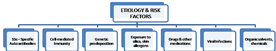
FIGURE 3: Etiology and risk factors of scleroderma

Figures 3, 4 show the etiology, risk factors, and etiopathogenesis of scleroderma.