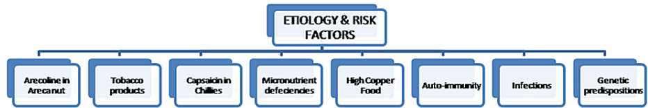
FIGURE 1: Etiology and risk factors of oral submucous fibrosis