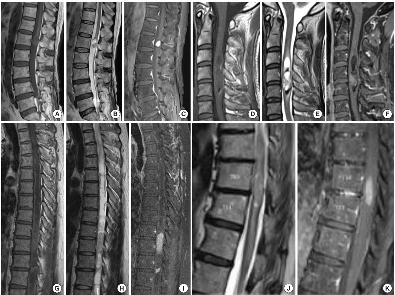
Fig. 2. Preoperative magnetic resonance imaging (MRI) findings in patients with preoperative diagnosis of ependymoma. (A–C) Case 1. Preoperative MRI showing an isointense mass on the sagittal T1-weighted image (A), iso-high intense on T2 weighted image (B), and homogenously enhanced on T1-weighted image with gadolinium with cystic lesion at the conus medullaris (C). (D–F) Case 7. Preoperative MRI showing an isointense mass on the sagittal T1 weighted image (D), mixed intense on T2 weighted image with hemosiderin deposition (E), and irregularly enhanced on T1-weighted image with gadolinium at the C3–5 level (F). (G–I) Case 10. Preoperative MRI showing an isointense mass on the sagittal T1-weighted image (G), mixed intense on T2-weighted image with syringomyelia (H), and homogenously enhanced on T1-weighted image with gadolinium at the T9–10 level (I). (J, K) Case 11. Preoperative MRI showing an iso-high intense mass on T2-weighted image with edema (J) and homogeneously enhanced on T1-weighted image with gadolinium at the T10–11 level (K).

The localization and extension of the tumors in the cases included in this study can be divided into 2 main types: those that are completely intramedullary. One was completely intramedullary and the other was intramedullary to extramedullary extension. Considering these developmental mechanisms and tumor localization, each type may have a different developmental mechanism. The location within the spinal cord where the above mechanisms occur may determine the morphology of the tumor. That is, tumors that arise near the surface of the spinal cord are thought to have exophytic lesions, while tumors that arise in