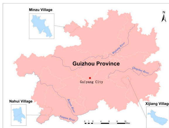
Fig. 2. Minzu, nahui, and Xijiang in Guizhou province.

Then three professors, which research fields are respectively tourism management community participation, and rural tourism development. Experts gave marks to the scale questions and filled in their opinions. According to the experts' assignment of each influencing factor, the indexes with scores less than 20 points were deleted. In addition, two of the experts agreed that the variable “quality of tourism public services” was not reasonable, and the question in it is repeated with other questions and should be deleted.