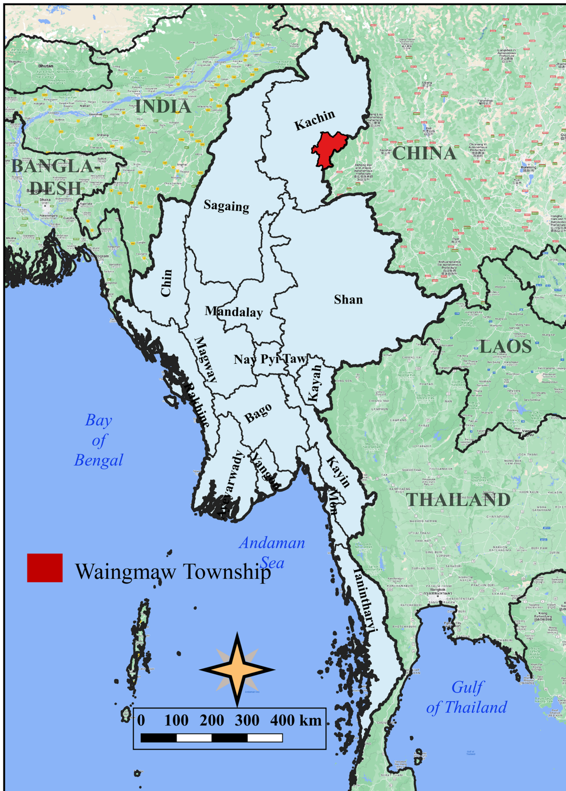
Fig. 1 Map of the study township in northern Myanmar