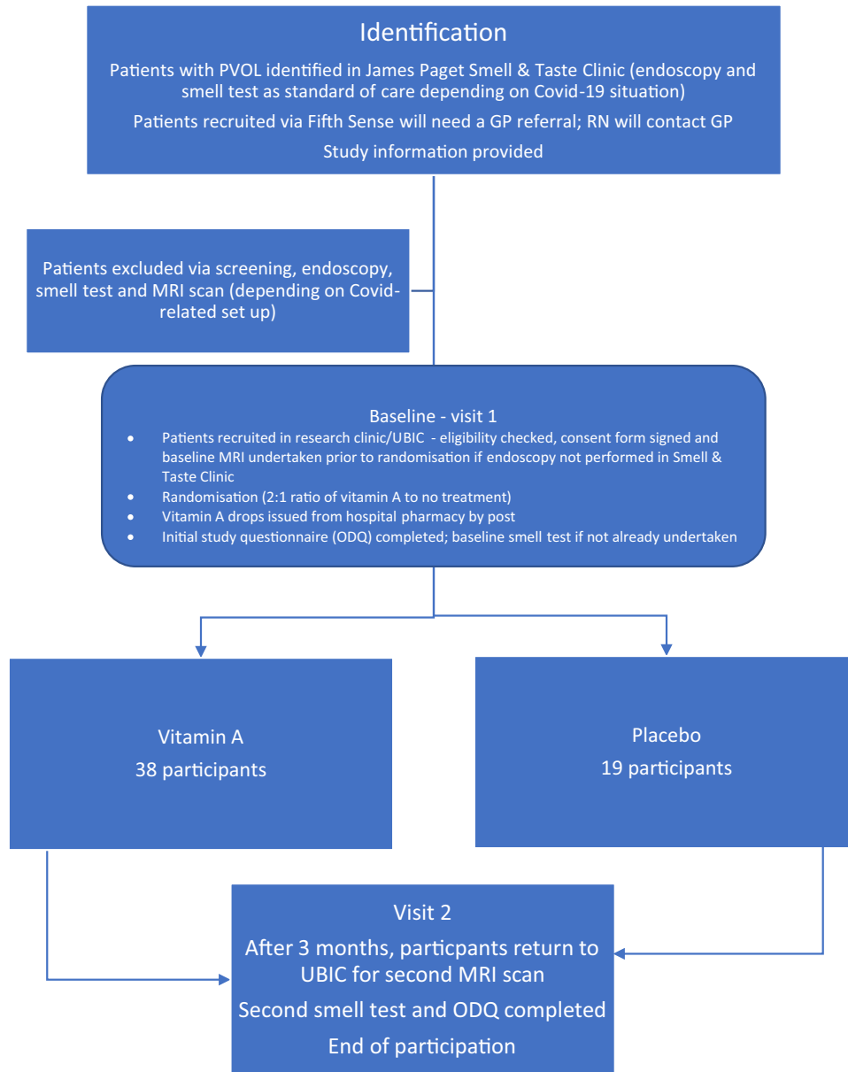
Fig 1 Vitamin A study flowchart