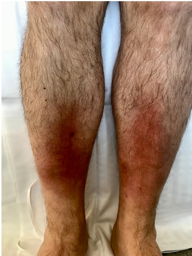
Figure 1 Erythema nodosum on both shins during hospitalisation.