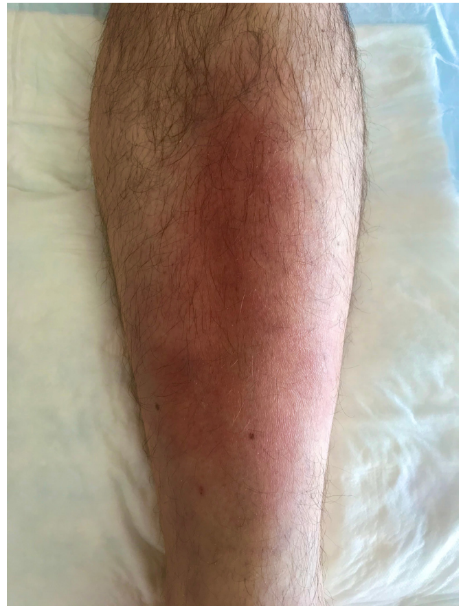
Figure 2 Erythema nodosum on the left leg at end of hospitalisation.

In the currently available literature, there is little research on skin manifestations associated with COVID-19. Recalcati has postulated a cutaneous involvement similar to that found in common viral infections, in 20.4% of patients among their cohort of 88 patients. The described cutaneous manifestations included erythematous rash, widespread urticaria and chickenpox-like vesicles. 5 Two cases of transient unilateral livedo reticularis were also reported by Manalo et al as a manifestation of COVID-19 thought to be due to a microembolic event. 6 Progressing pruritic lesions on both heels that became erythematous plaques were also described in a 28-year-old healthy woman. 7 In another case report, petechiae was described in a Thai patient, which could be wrongly interpreted as dengue. 8