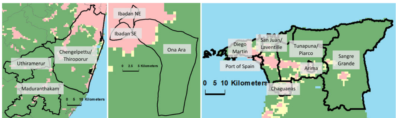
Fig. 1. (a–c). Maps of INTREPID II catchment areas in India, Nigeria and Trinidad. Black borders indicate the boundaries of the total catchment area in each setting and the administrative areas within these. Green, yellow and pink voxels indicate level of urbanicity according to the GHS-SMOD classification system using the Degree of Urbanisation (DEGURBA) methodology, developed by EuroSAT (Florczyk et al. , 2019; Joint Research Centre (JRC) European Commission, & Center for International Earth Science Information Network – CIESIN – Columbia University, 2021). EuroSAT’s DEGURBA methodology. This applies a set of decision rules that consider population and built-up area densities derived from the GHS-POP and GHS-BUILT data sets, which use spatial data mining technologies that rely on a combination of fine-scale satellite image data streams, census data, and crowd sourced or volunteered geographic information sources (see https://sedac.ciesin.columbia.edu/data/set/ghsl-population-built-up-estimates-degree-urban-smod ). Pink indicates urban areas (Class 30: ‘Urban Centre’, Class 23: ‘Dense Urban Cluster’, and Class 22: ‘Semi-dense Urban Cluster’), yellow indicates peri-urban areas (Class 21: ‘Suburban or peri-urban’), while green indicates rural areas (Class 13: ‘Rural cluster’, Class 12: ‘Low Density Rural’, and Class 11: ‘Very low density rural’).

For comparison, in the Census of India urban areas were defined as ‘all places with a municipality, corporation, cantonment board or notified town area committee, etc. (‘Statutory Towns’), and all other places which satisfied the following criteria (‘Census Towns’); minimum population of 5000; at least 75% of the male main workers engaged in non-agricultural pursuits; and population density of at least 400 per sq. km’ (Census of India, 2011). In Trinidad, in the 2008/09 Household Budget Survey, wards with 200 or more residents per square kilometre were classified as urban and the remainder rural, with the exception of wards ‘located in urban areas with 40 or more agricultural holders and/or at least 48 hectares under agricultural cultivation (as reported in the 2004 Agricultural Census) with an element of remoteness such as distance from main cities or difficult access’, which were classified as rural (Central Statistical Office of Trinidad & Tobago, 2009). In Nigeria, an area is classified as urban on the basis of the population size (20 000 or more) or