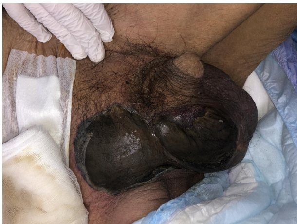
DOI: 10.12998/wjcc.v11.i27.6498 Copyright ©The Author(s) 2023.