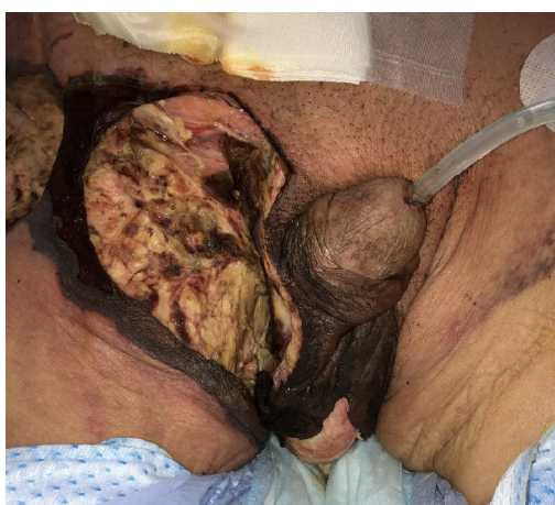
DOI: 10.12998/wjcc.v11.i27.6498 Copyright ©The Author(s) 2023.