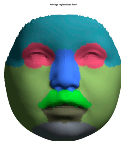
Figure 1. Selected areas for assessing facial development and growth: forehead (light steel blue), eyes (rose), nose (royal blue), upper lip and subnasal (lime green), lower lip (anthracite), cheeks (olive green), and chin (grey).

Average faces were generated for 3 (T1), 9 (T2), and 12 months (T3) of age. The comparison of the average faces at the defined time points (T1 to T2 and T2 to T3) was visualized by color-coded maps.