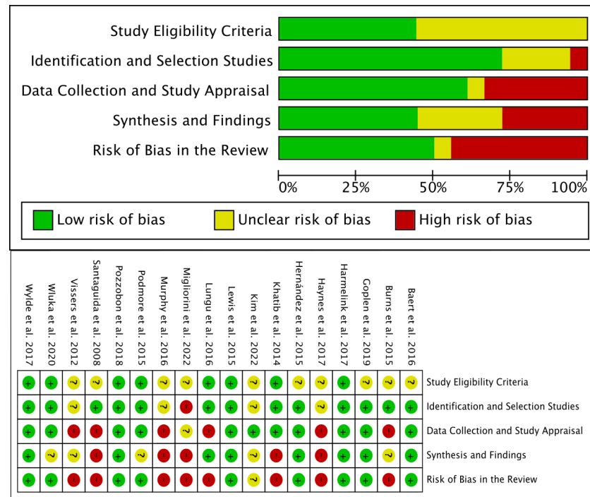
Figure 2. Risk of Bias (RoB) assessment using the GRADE tool [31–48].

Eight (8/18, 44.5%) reviews [33,37,39,41,44–47] were considered of high RoB, one (1/18, 5.5%) review [35] was considered of unclear/moderate RoB, and the remaining nine (9/18, 50%) reviews [31,32,34,36,38,40,42,43] of low RoB (Figure 2).