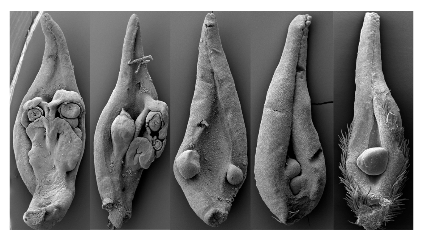
Figure 1. The variation spectrum of carpel morphology in a single tree of Michelia figo (Magnoliaceae) reveals that a carpel is a composite organ derived from the synorganization of a leaf and its axillary ovule-bearing branch (placenta).

The term "sporophyll" is a misconception that should be discarded in the botany of seed plants, despite its wide usage and popularity. The removal of "megasporophylls" undermines the validity of the Euanthial Theory, as the former is a core concept founding the latter.