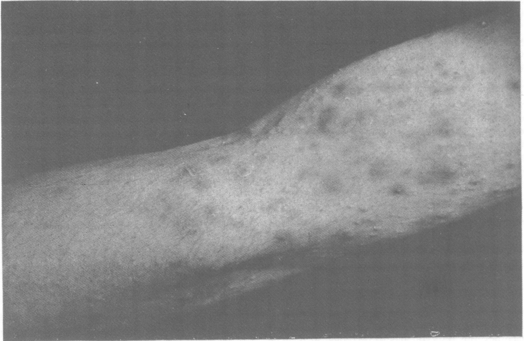
PLATE I. —Severe Oil Folliculitis—showing comedones, folliculitis and granulomatous lesions.