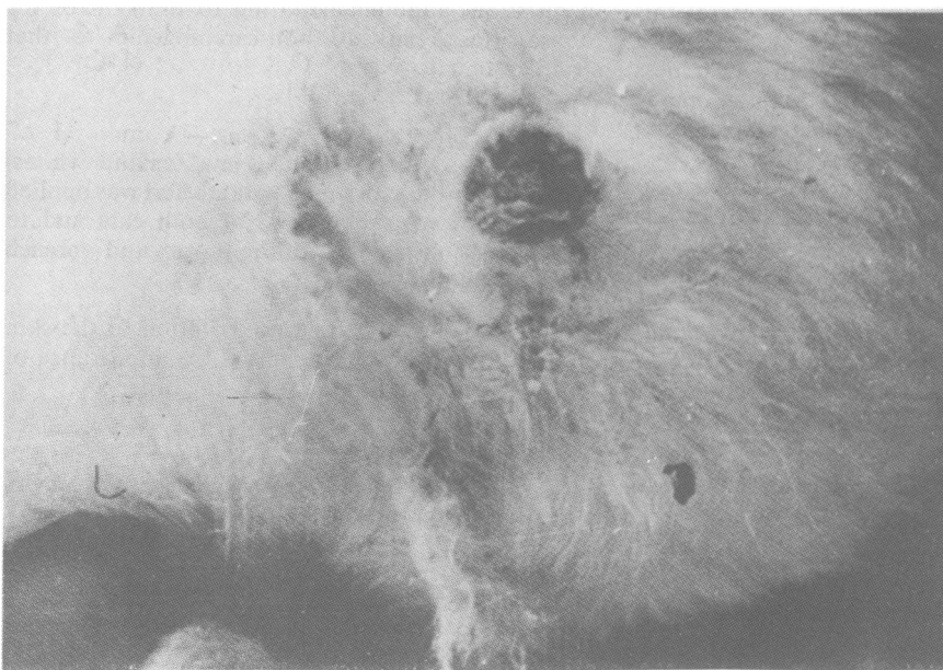
PLATE III.—Papilloma on left flank of Rabbit I. Appeared after 24 weeks' painting with cutting oil. Growth is of 8 weeks' duration.