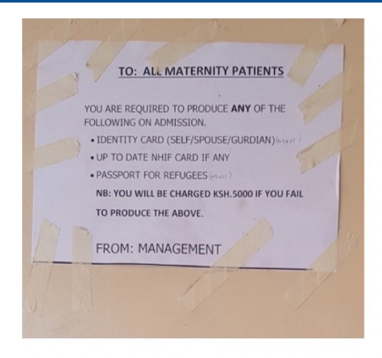
FIGURE 2. Example of Posters Used in Some Kenyan Public Health Facilities to Inform Clients of Free Maternity Policy Registration Requirements

[Small facilities] are offering [FMP], but they are not claiming [because of] few staff [or] they don't have somebody for logistics and claiming. Some of them like in [the county] were innovative ... when they deliver, they send their data through a hospital. They claim as