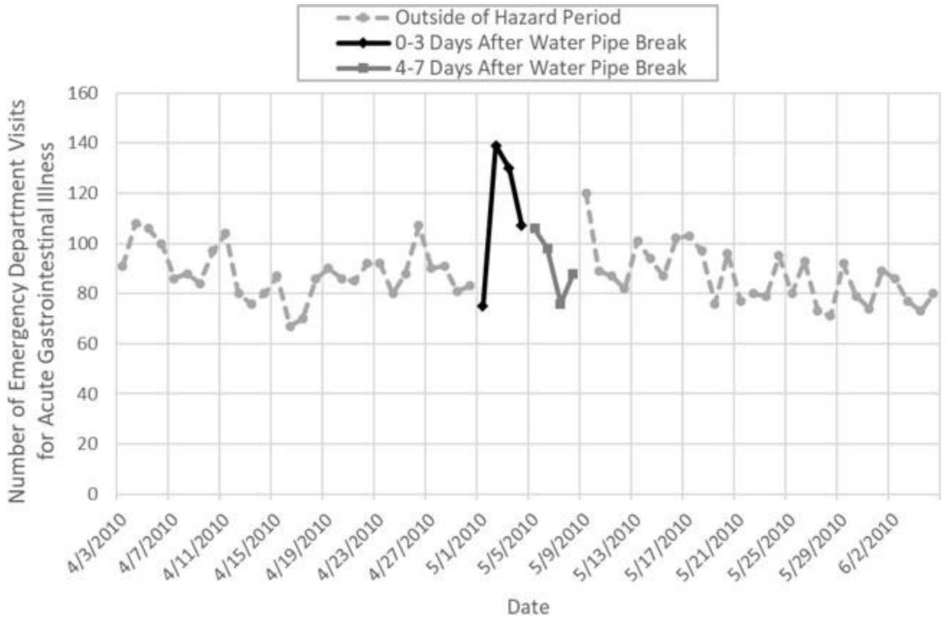
Figure 2. Number of Emergency Department Visits for Acute Gastrointestinal Illness in 30 Boston Metropolitan Communities, April 3, 2010 - June 5, 2010.