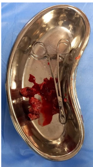
Fig. 1 Gross image of RPOC

Two-dimensional ultrasonography is easily available and non-invasive tool for the diagnosis of RPOC; however, it has very high sensitivity with low specificity to