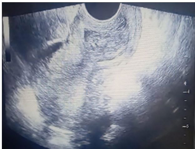
Fig. 3 Placental polyp