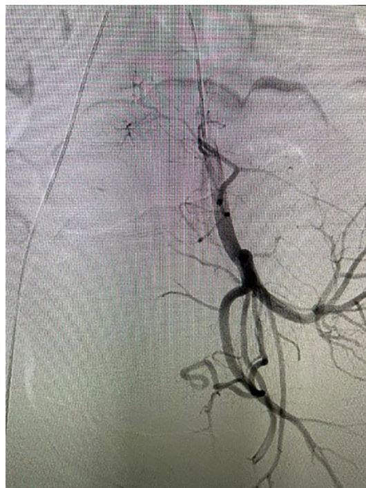
Fig. 5 AVM on digital subtraction angiography

Thus, no simple, distinguishing finding or characteristic is present for aiding the diagnosis of both these diseases.